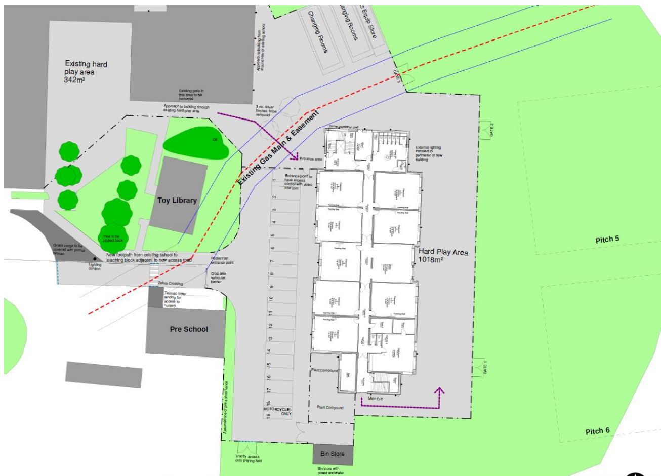
Figure 2. Proposed Site Layout Plan.